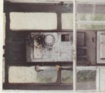
The town of Suceava where, judging by the chains, there is a vandalism problem. Works on rare 20 lei coins which are worth about a penny.