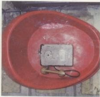
A cheerful sight in Kiev.