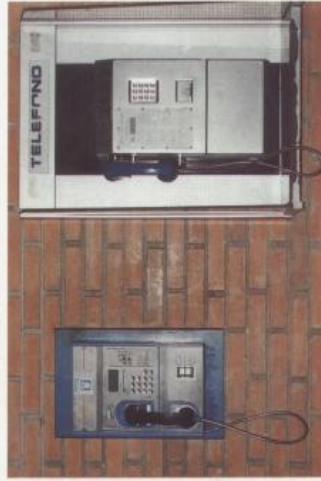
Two styles of payphones: the one on the right uses coins, however, rampant inflation makes their operation difficult at best. The phone on the left uses cards - a system which has yet to be hacked. Occasionally, though, these phones inexplicably let people talk forever. You will find long lines when this happens.