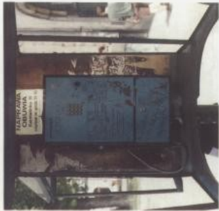
Found in Warsaw. Something this size has to do more than make phone calls.