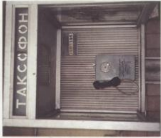
Residing in Moscow.