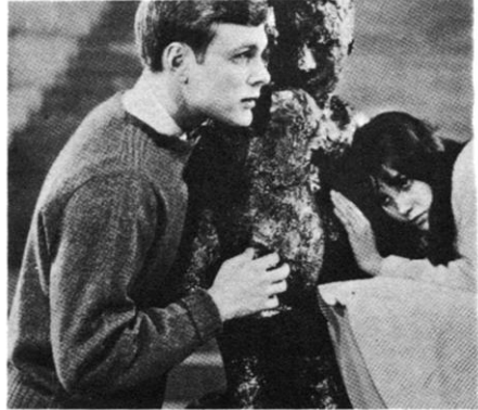
Keir Dullea and Janet Margolin: DAVID AND LISA.