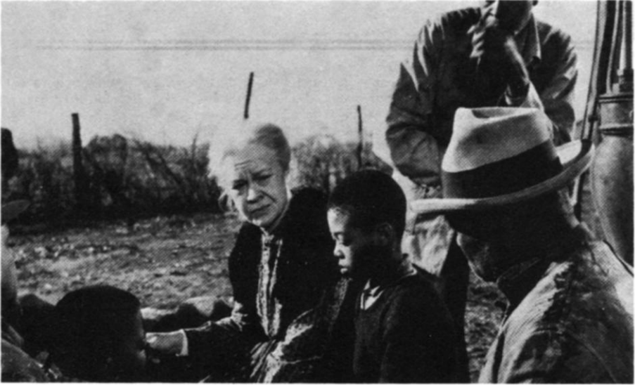
Relationships within the CinemaScope image: a scene from Kazan's WILD RIVER.

rest of the image is not useless. We may not be conscious of what exactly is there, but we are marginally aware of the objects and the space on either side. It is this peripheral vision which orients us and makes the experience so vivid. Similar effects were tried in the early films in Todd-AO (roller-coaster; train ride) and CinemaScope (the shots from the nose of the plane in How to Marry a Millionaire ). In Scope the involvement is less strong, but it is still considerable: so are its implications. Although the shots quoted aim at nothing more than a circus effect, physical sensation of this kind can be dramatically useful (elementary form-and-content). This power was there even in the 1:1.33 image, but for the most part (after Lumière's train) remained latent. But there are classic examples of movement in this plane in Renoir's Partie de Campagne : the long-held shot at the end, taken from the stern of the boat being rowed home; rain on the water: an overwhelming sense of nostalgia conveyed by the movement. And in Wyler's The