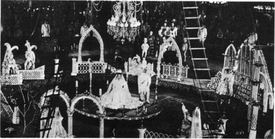
The circus in Ophüls' LOLA MONTÈS (see review in this issue).

both angles, how it is shot, and how we see it. If it is to pass, it must be analytic rather than synthetic: instead of taking an insert CU, then, against a neutral background, the director will have to recreate the ambience of the whole, and this helps the actor. The actor at the same time is freer to move within the frame, and thus within his surroundings, instead of being "placed carefully before the camera". Mariette Hartley, the girl in Ride the High Country , stands at the window of her house, talking to a boy: Scope close-up: she moves around nervously while she talks, and the director (Sam Peckinpah) doesn't have to worry about keeping her fixed to any chalk-marks because there is room enough within the frame; the effect is marvelously spontaneous.