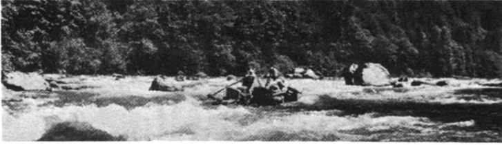
HOW THE WEST WAS WON— proportions of Cinerama.