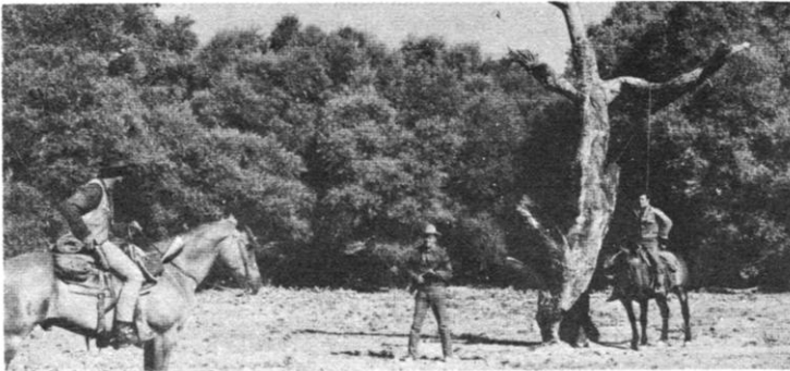
From Boetticher's RIDE LONESOME.

This in turn affects the spectator, who has to take on trust the connection between the close-up and the rest of the scene; man + situation tends to become a formula, a cruder digest of a reality which is continuous and complex. "If I were to throw in ten more details, everything in my films would suddenly become extremely clear. But those ten details are just what I don't want to add. Nothing could be