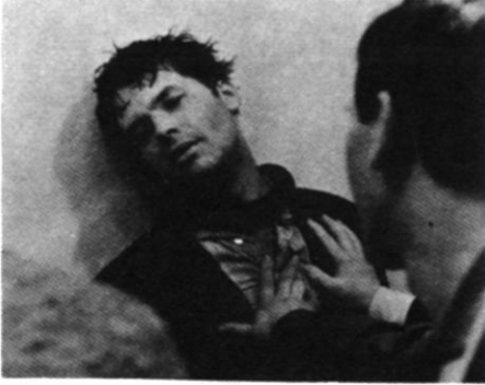
LOVE AT AGE 20: Wajda's episode.

serious and solitary person does tell them a few things. The two worlds are confronted, neatly and quietly, in words and looks; they touch nowhere. The friends rush off suddenly to look over the girl's shoulder at a geometry problem; Cybulski is left totally alone in the other room. Pretty drunk by now, in a game of blind man's buff he has a kind of reminiscence-seizure, in which he relives an execution scene from the war; we see this as he sees it, but all the young people see is a drunken man rolling about embarrassingly in the corner. After a while he sobers up enough to leave, dismissing the photographer who accosts him outside. At dawn the photographer makes his re-entrance — the pictures are stunning — and goes off with the girl to romp outside.