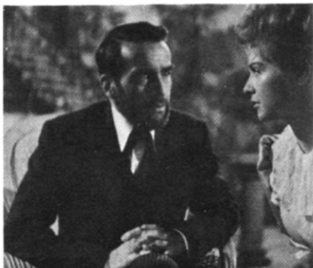
FREUD (reportedly to be retitled SECRET PASSION).

What the film lacks most grievously is a satisfactory embodiment of the quality of