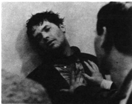
LOVE AT AGE 20: Wajda's episode.

serious and solitary person does tell them a few things. The two worlds are confronted, neatly and quietly, in words and looks; they touch nowhere. The friends rush off suddenly to look over the girl's shoulder at a geometry problem; Cybulski is left totally alone in the other room. Pretty drunk by now, in a game of blind man's buff he has a kind of reminiscence-seizure, in which he relives an execution scene from the war; we see this as he sees it, but all the young people see is a drunken man rolling about embarrassingly in the corner. After a while he sobers up enough to leave, dismissing the photographer who accosts him outside. At dawn the photographer makes his re-entrance — the pictures are stunning — and goes off with the girl to romp outside.