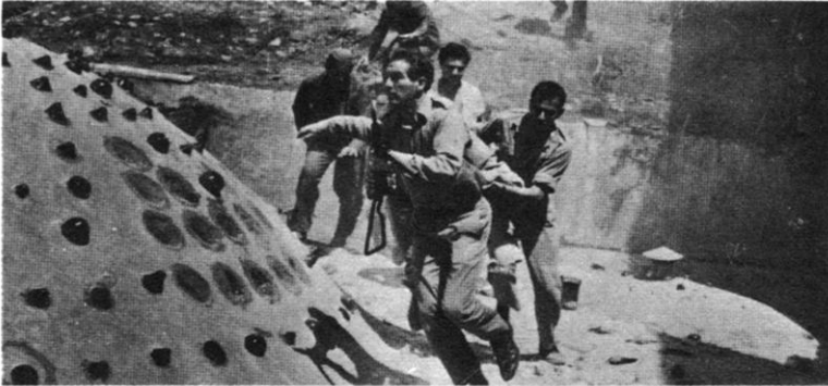
The open image: Preminger's Exodus.

our objective picture of the scene, whereas if transposed to film they would distract, and distort (imagine a close-up of the fender, grinning idly). For filming this passage from Tess I can't imagine a better method than to keep both of them in the frame the whole time, with the "material objects" around and between them, and to have her explanation, and then his silence, and reactions, in a single take, without any overt emphasis from the camera. Ideally, in CinemaScope, which makes the surroundings more palpable, and enables you to get close to one or both of the characters without shutting out the rest of the scene. The more precisely the camera charts the substance of things, the external movement of words, expressions, gestures, the more subtly can it express the internal movement: the essence of things.