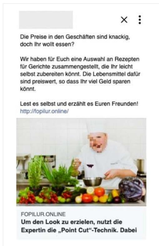
Image: An ad run by a compromised Page, targeting audiences in Germany. We blocked it before it was seen by anyone.