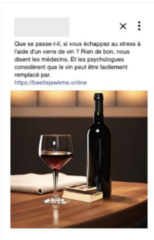
Image: An ad run by a fake account, targeting audiences in France. The operation tried multiple times to run the same copy with different images of a wine glass, likely generated by AI. This ad was blocked before it was seen by anyone.