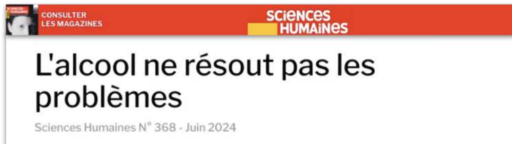
Image: a screenshot of a headline of the article translated to “Alcohol doesn't solve problems”

The ultimate destination for the link in the ad was a geofenced spoof of the online magazine Sciences Humaines. A non-French online user would get directed to a web page (outside of Facebook) with nonsensical text. But a France-based internet user would get routed to an article on a spoofed online magazine Sciences Humaines about how French citizens are drinking too much because of the stress caused by the alleged plans of President Macron to send French soldiers to Ukraine.