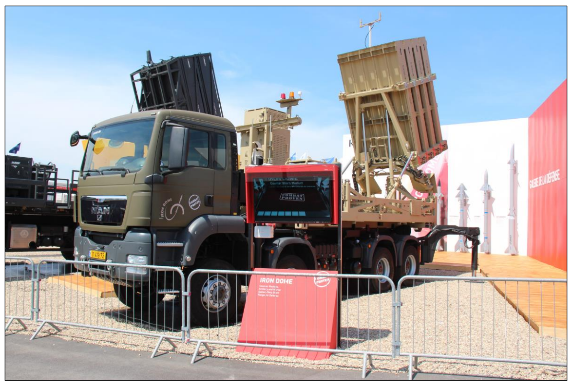
Figure 3. Iron Dome Launcher