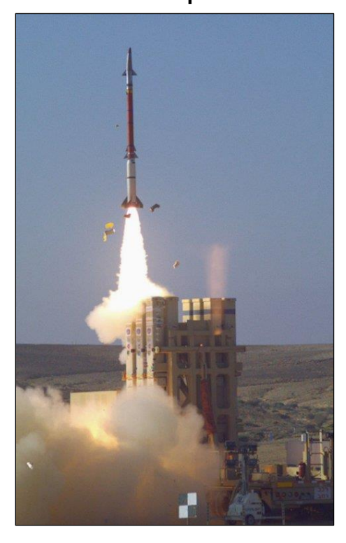
Figure 4. David's Sling Launches Stunner Interceptor

Since 1988, Israel and the United States have been jointly developing the Arrow Anti-Missile System. The Arrow is designed to counter short-range ballistic missiles. The United States has funded just under half of the annual costs of the development of the Arrow Weapon System, with Israel supplying the remainder. The Arrow II program (officially referred to as the Arrow System Improvement Program or ASIP), a joint effort of Boeing and Israel Aerospace Industries (IAI), is designed to defeat longer-range ballistic missiles. One Arrow II battery is designed to protect large swaths of Israeli