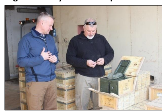
Figure 5.Army Officers Inspect WRSA-I