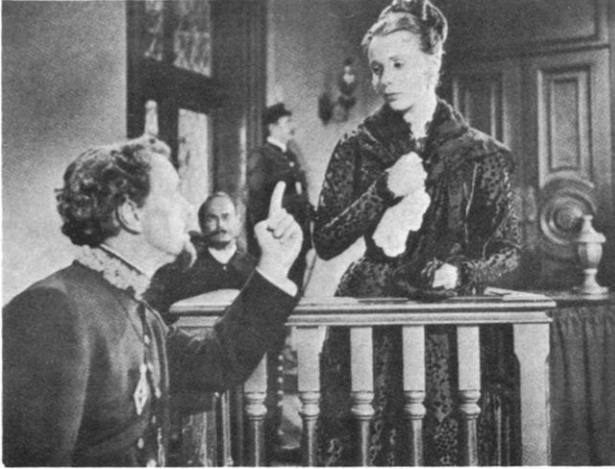
THE BROTHERS KARAMAZOV: Both justice and film go to pieces in this trial scene.

Judge, a grim, neanderthal stab at comedy. Ginger Rogers, again, has been through a lot. In I'll Be Seeing You she was out on Christmas parole; but the ex-hooper truly made legal history when, as Roxy Harie , she was acquitted for murder—entering a plea of temporary lunacy by way of a “purple flash” (nothing permanent, mind you) in her fine incarnation of a jazz-age tart. Ann Sheridan was once a fugitive Woman on the Run ; but she was even nobler as Nora Prentiss , a non-talking witness who refused to clear a man in order to save his honor instead. Remember the blurb on that one: “If you were Nora Prentiss, would you keep your mouth shut?” Annie did.