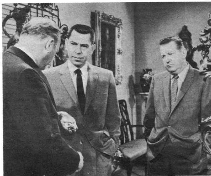
DRAGNET: The crushing revelation.

Webb questions as many as ten persons on a single program. These are "fresh faces" (and