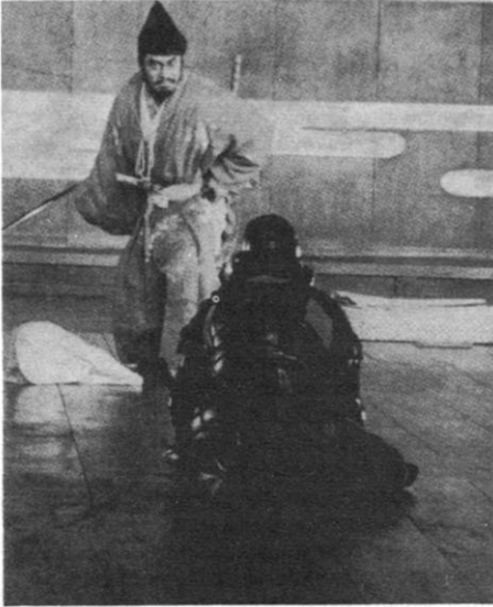
KUMONOSU-JO: The messenger brings the head of Duncan.

sensational news items from the daily press. Originally the Japanese screen was cluttered with filmed Shimpa but nowadays, though the Shimpa attitude of sentimentality for its own sake has found a secure place for itself in the Japanese films, relatively few pictures use Shimpa stories. Of these, foreigners have seen at least one, the lachrymose Konjiki Yasha (The Golden Demon), based on a Shimpa version of a popular novel. Actually, at present the majority of Shimpa plays are based upon successful films.