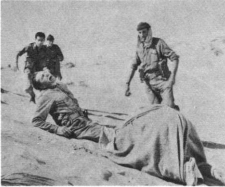
A Libyan desert scene from BITTER VICTORY.