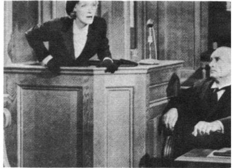
WITNESS FOR THE PROSECUTION: Marlene "breaks down" on the stand.

In passing we can note the adventures of a handful of Joans of Arc. Otto Preminger in his St. Joan (written for the screen by the Cath-