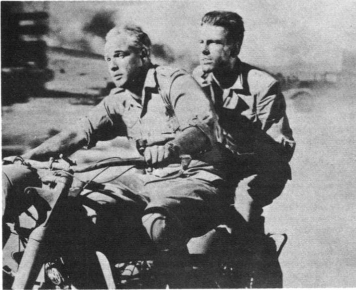
THE YOUNG LIONS: Diestl and his commanding officer, who relentlessly urges him on, is for safety a the British break-through.

an attempt is made to cover anti-Semitism and the kind of personal courage which is required to survive it, the possibility of private, individual responsibility within a Nazi war machine, and the transformation of a draft-dodger into a kind of front line hero. All in one film. There is no reason why something like this should not be attempted. And an attempt, as heroic as this one was, should be acknowledged for what it is. But the intention must not be taken for the deed.